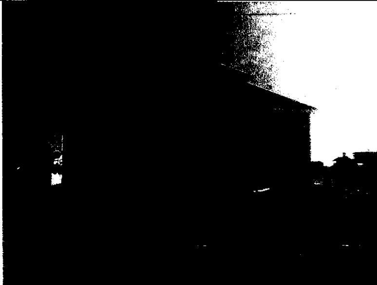
21 One Eye Way, Front, 10/23/15

If using the Elevation Certificate to obtain NFIP flood insurance, affix at least 2 building photographs below according to the instructions for Item A6. Identify all photographs with date taken; "Front View" and "Rear View"; and, if required, "Right Side View" and "Left Side View." When applicable, photographs must show the foundation with representative examples of the flood openings or vents, as indicated in Section A8. If submitting more photographs than will fit on this page, use the Continuation Page.