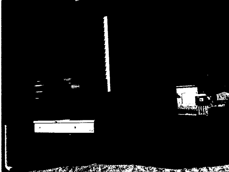
21 One Eye Way, A/C / Right side/Rear, 10/23/15

If submitting more photographs than will fit on the preceding page, affix the additional photographs below. Identify all photographs with: date taken; "Front View" and "Rear View"; and, if required, "Right Side View" and "Left Side View." When applicable, photographs must show the foundation with representative examples of the flood openings or vents, as indicated in Section A8.